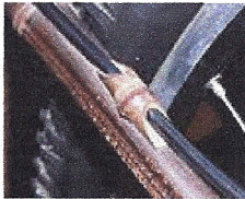
Tons of neat details